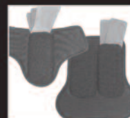
ADJUSTABLE WEIGHTED LINERS AVAILABLE