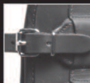
SECURE BUCKLE CLOSURES

CONFORMS TO EACH HORSE'S LEG FOR A CUSTOM FIT EVERY TIME, REDUCING THE RISK OF RUBS