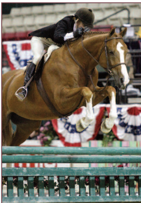
Lumiere jumped to the top of the WCHR A/O Challenge.